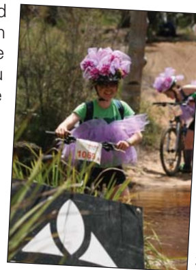
Watch out for thistles

All other category placegetters and full Results can be found on www.wildhorizons.com.au . Please note these are interims only. If you have a query on your time/place then please email timing@wildhorizons.com.au before 21 November.